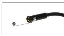
magnet pick up (included)